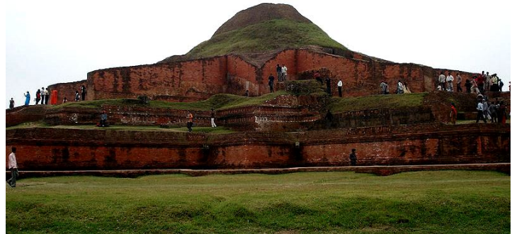
Somapura Mahavihara in Paharpur, Bangladesh

We are very happy to release this Special Issue on the Temples of Bengal (from the Ancient Period to the 19 th Century). It has been quite an experience for us working with the issue—exciting and tough at the same time. The topics relating to this are many and the areas are vast. We planned to follow a holistic approach to it and laid down some selected areas. We also