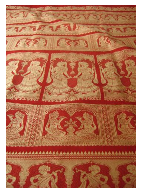
The aanchal or pallu of the saree depicts festive mood. Some women are engaged in several musical activities. Some are playing on Veenas (A musical instrument), Some are blowing on conches and some are involved in dancing with instruments in hands.

Gautam Patel Working in Gujarat in social development