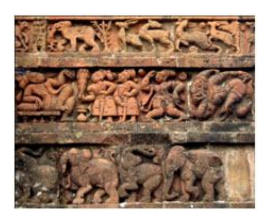
The motifs in the terracotta temples had a decisive influence on Baluchari designs