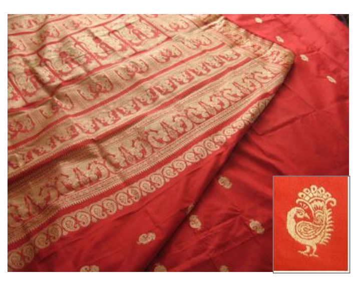
This is a beautiful instance of a bright red Baluchori saree. The body of the sari is decorated with tiny peacock motifs.

carrying the warp thread to be woven with the weft thread. These hooks can be connected to more than one thread, allowing multiple weaving of a repeat of a pattern.