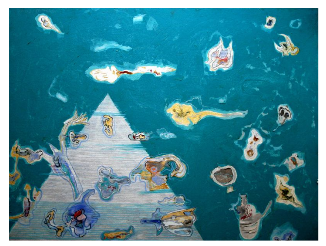
Trimorphous Triangle, 2006, 112 x 119 cm. Collection: Artist