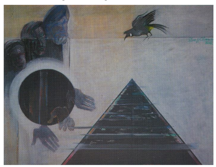
Bul Bul + 1, 2002, 93 x 104 cm. Oil on canvas. Collection: JK Academy, Srinagar.

In the recent years his paintings have adopted a relatively lesser contrast than his previous works. The painterly outlook has also considerably shifted from a morose or robust expressionist mode to the more subtler grayish and pleasantly low key undertones. The paintings reveal a far greater tendency towards abstraction. However, the previous aesthetic engagement with the triangles still preoccupies a seminal formal/conceptual paradigm. The paintings such as Untitled, 2006, Trimorphous Triangle, 2006, Untitled, 2007, Pissing on the Triangle of Morality, 2008, Iron in the Apple, 2010, The Rustic, 2010, Adams Apple, 2010 while still dwelling in the old shrewd tactics of wit and satire they are also characteristically different for incorporating an assemblage of well-wrought visual transformations; abstracting the identifiable commonplace motifs of nature into a plethora of visual metaphors of disparate variables.