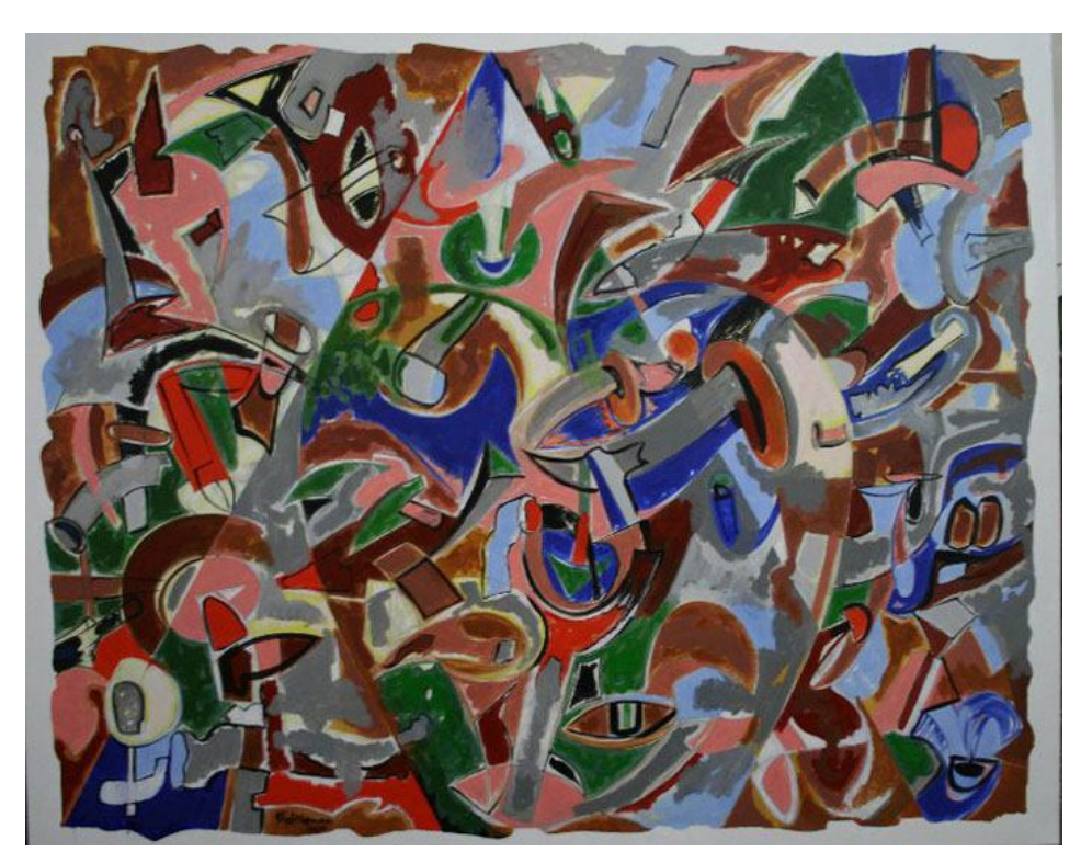
Iron in the Apple, 2010, 152 x 121 cm. Collection: Artist