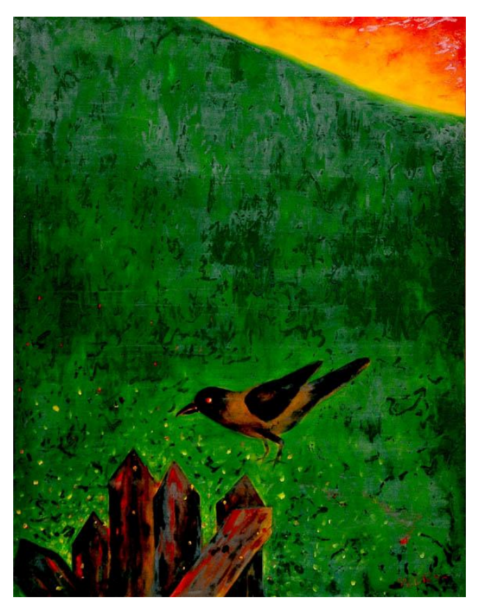
Untitled, 1997, 92 x 112 cm. Oil on canvas.

bewilderment that attend the predicament of exile. To his credit, the volatility of such emotions is tuned to a fine pitch of poignancy, the restrained cadence of the elegiac ii