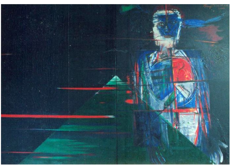
Anantnag, 2002 Oil on canvas. Collection: Artist

The triangle of punishment, trimorphous punishment which exists in the distinct forms; Body–Spirit. My hermaphrodite subjective process may not be universally comprehensible or explicable but the assignment of the punishment needs to be dealt by the objective punishment of the conceptual trigonometry; 1 – the conscious, 2- the intellect, 3- the vision (the inner vision). The modeling of silence in three dimensions, the Perfect Triangle (the relative term) of human knowledge. The punishment of being a painter – the base for my fabric is the direct result from the conflict of attractions, the influence of an essential triangle, no, not the two men and a women, neither the two women and a man but only one man and the all women, the all men of earth, water and fire.