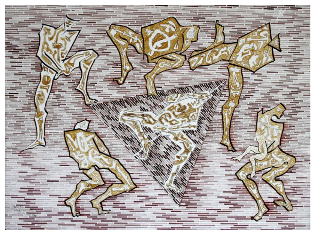
Pissing on the Triangle of Morality, 2008, 98 x 106 cm. Collection: Artist